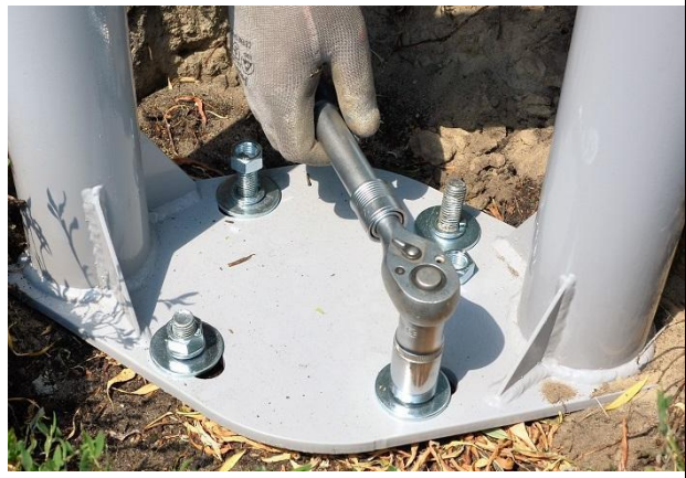
4. Make sure that the device is properly mounted. It should adhere well to the foundation (the foundation should be smooth and level)

All the washers and nuts are supplied in a set