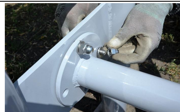
7. Bring the device to the installation area on the 8. When 1 screw is installed, apply the other 3 screws.