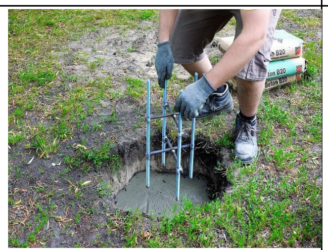
7. Insert the metal anchor provided with the fitness device into the concrete.

When installing only a few fitness machines it makes sense to prepare the concrete on site. A 500x500x500mm hole requires approx. 10 bags of 25kg ready mix concrete mixed with water.