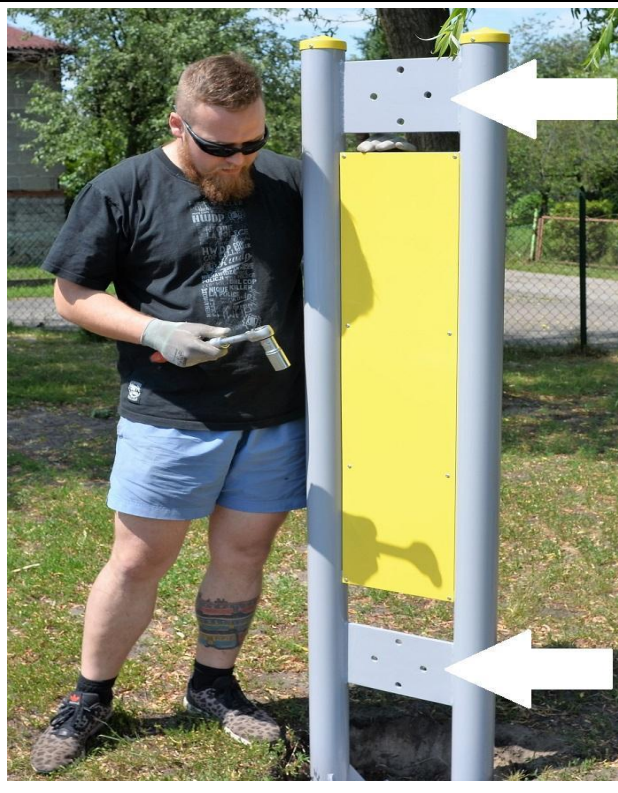
5. After installing the pylon to the foundation, you can now start to install the fitness device or two if that is the case.

The pylon is ready to accept the fitness device (or 2).