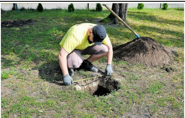
4. Make sure that the hole is of the right dimensions. It should be at least 500mm long, 500mm wide and 600 mm deep.