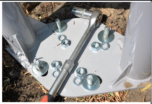
3. In order to mount the pylon to the anchor you will need: 4 galvanized standard washers, 4 galvanized split washers, 4 galvanized nuts 16mm diameter and a no. 24 wrench.

Be sure not to damage the threads of the anchor.