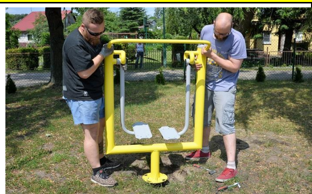
1. Position the device on the threaded bolts sticking out of the anchor in such a way as to not damage the threads.