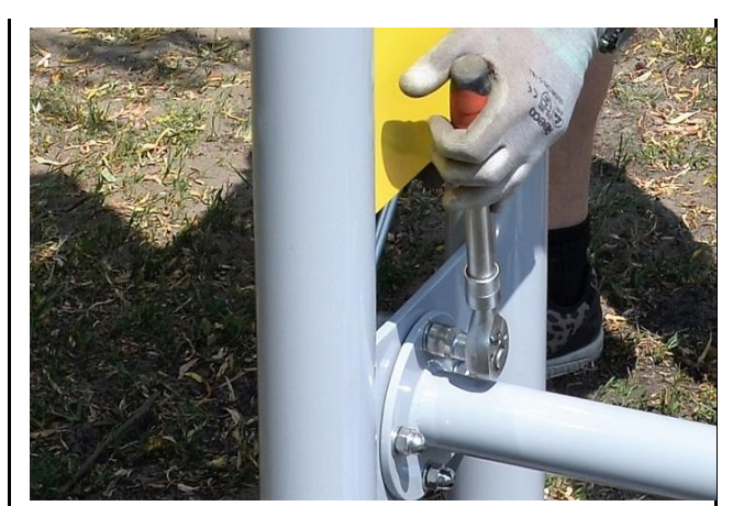
9. Tighten the screws.