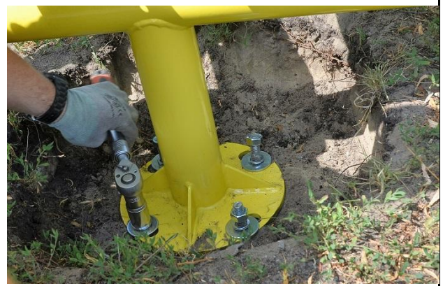
3. On every thread apply: a normal wide washer, then on top of it a split washer and finish with a nut. Tighten delicately with a no. 19 spanner.