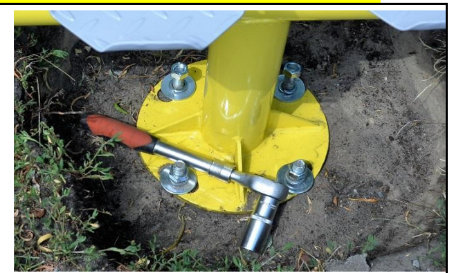
2. To mount the pole to the foundation you need: 4 normal galvanized washers (wide ones), 4 galvanized split washers, 4 16mm galvanized nuts and a no.24 wrench. All the washers and nuts are supplied with the device.