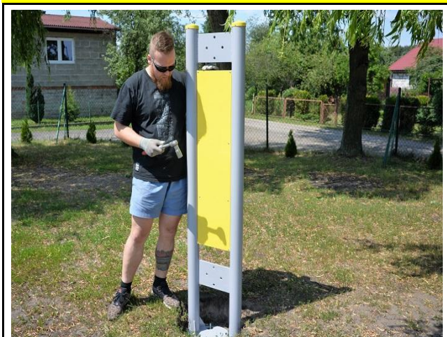
1. Clean the surface of the foundation and position the pylon on the ready hard foundation.