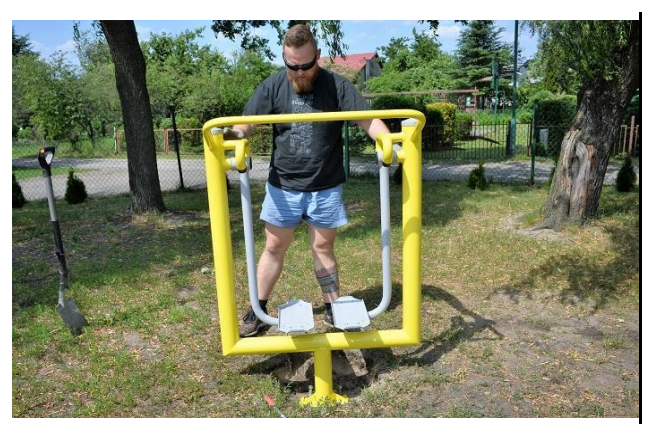
4. Check to see if the device is properly mounted (vertically and horizontally) and make sure it is stable.

If it is crooked, add more wide washers to make up for errors. When it is level, tighten the nuts and add the plastic end covers.