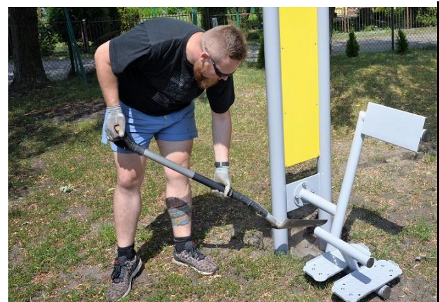
10. Add a covering layer of earth under the pylon and stick the instructions of use onto the pylon.