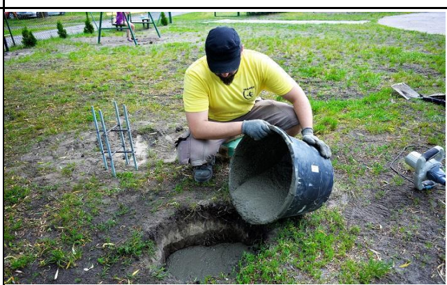
6. Pour in enough concrete to leave 100 mm from the surface of the concrete to ground level.

Pour the ready concrete into the foundation hole.