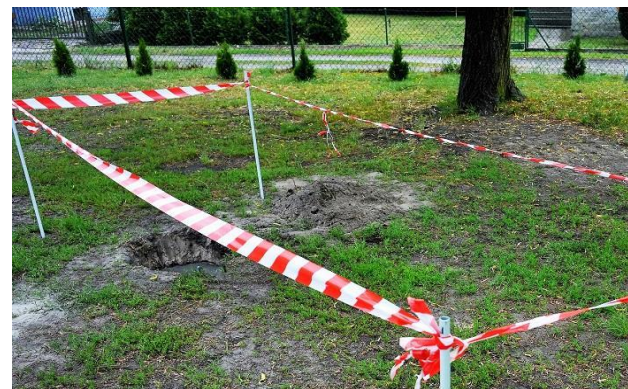
10. Secure the construction area and wait a few days until the concrete has hardened.