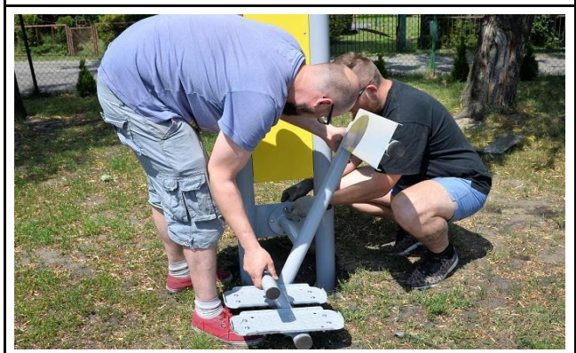
pylon and temporarily attach it with 1 screw.