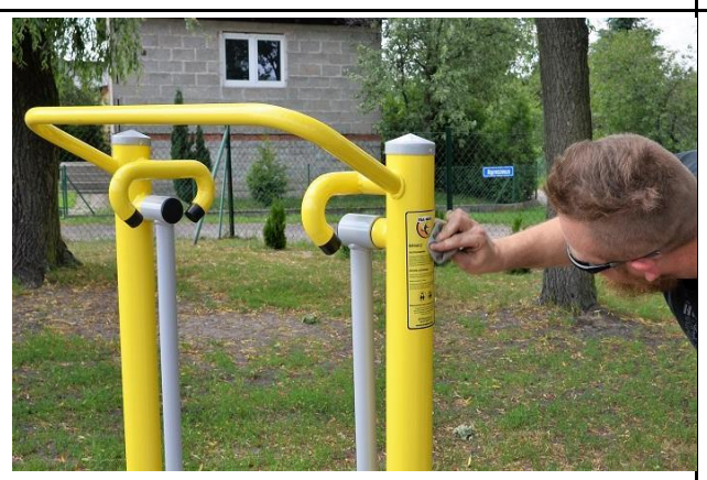
7. Next, using a cloth apply the rest of the sticker towards the sides. Make it adhere well (without bubbles). It must be legible.