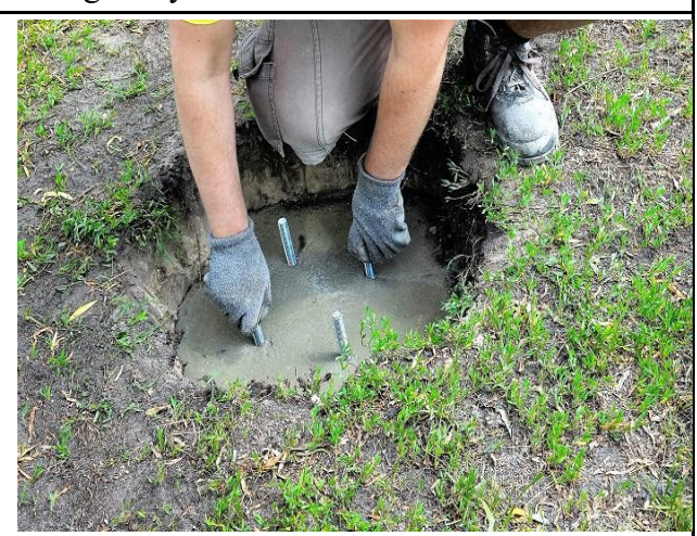
8. Move the anchor around in the concrete to ensure proper positioning.