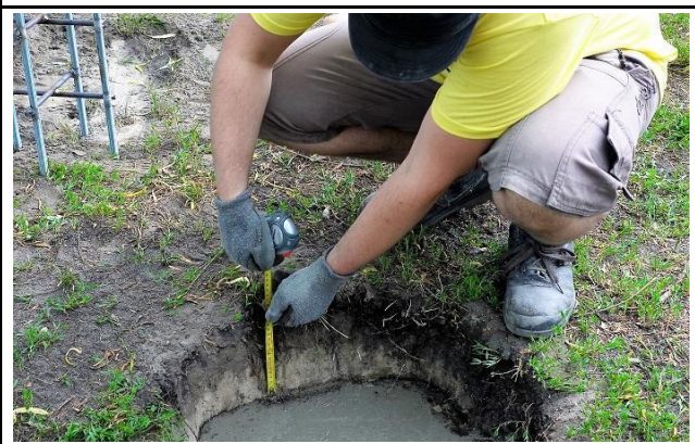
5. The foundations should be made from B20 or B25 concrete.