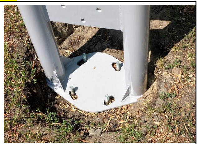
2. Place the pylon on the threads of the anchor sticking out of the foundation.

Be sure not to damage the threads of the anchor.