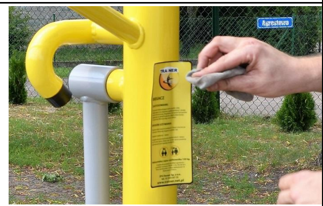
6. Stick on the user instructions. Do this carefully. Delicately stick the centre from top to bottom.