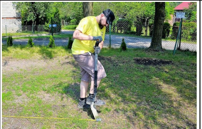
3. Dig a hole for the foundation. If the ground is granular use boarding