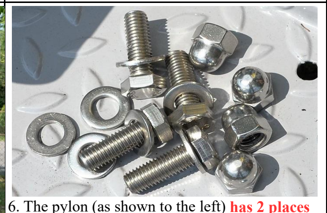
to mount devices (1 upper and 1 lower). Depending on the device, it is mounted to both places, or only to the lower one. In order to install a device to 1 place you will need: 4 bolts 12mm diameter 35mm in length (40mm in the case of mounting 2 devices) 8 washers, 4 cap nuts and a no. 19 wrench. The bolts, washers and nuts must be galvanized or made of stainless steel. Washers must be applied to both sides of the pylon, flat side to the pylon, rounded side to the nut.